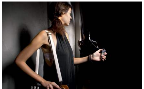
Using pepper spray for self-defence