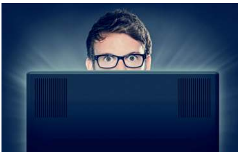
Addicted to the internet

Do you spend most of your free time in front of your PC? Do you use the internet much longer than intended? Do you think about your internet activities most of the day, even when you are not online? Is being online more important to you than meeting real friends? If you can answer